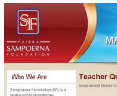
Screenshot of Sampoerna Foundation webpage